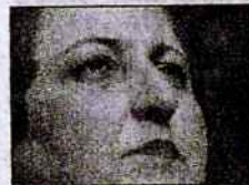
Shirin Ebadi is the first Iranian and first Muslim woman to win the honor.

PARIS — Iranian jurist and activist Shirin Ebadi was awarded the 2003 Nobel Peace Prize Friday in Oslo, Norway, for her longtime fight for human rights in her native land, becoming the first Iranian and the first Muslim woman to win the honor.