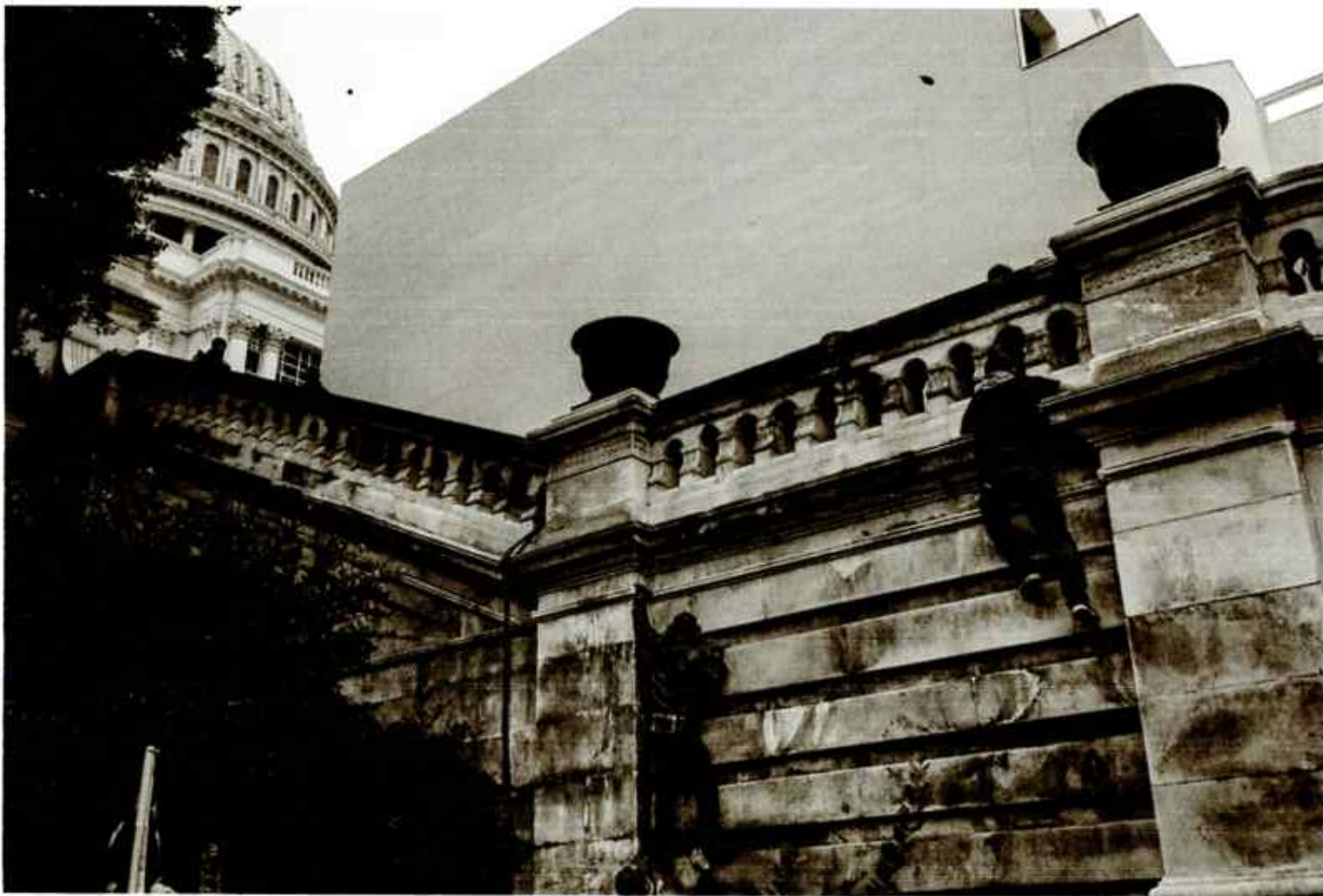
Pro-Trump extremists tried to scale the walls of the Capitol building in Washington to bypass barriers and get inside, 2:09 p.m.

Yet other Republicans saw the situation differently: They might actually break the system and have power without democracy. The split between these two groups, the gamers and the breakers, became sharply visible on Dec. 30, when Senator Josh Hawley announced that he would support Trump's challenge by questioning the validity of the electoral votes on Jan. 6. Ted Cruz then promised his own support, joined by about 10 other senators. More than a hundred Republican representatives took the same position. For many, this seemed like nothing more than a show: challenges to states' electoral votes would force delays and floor votes but would not affect the outcome.