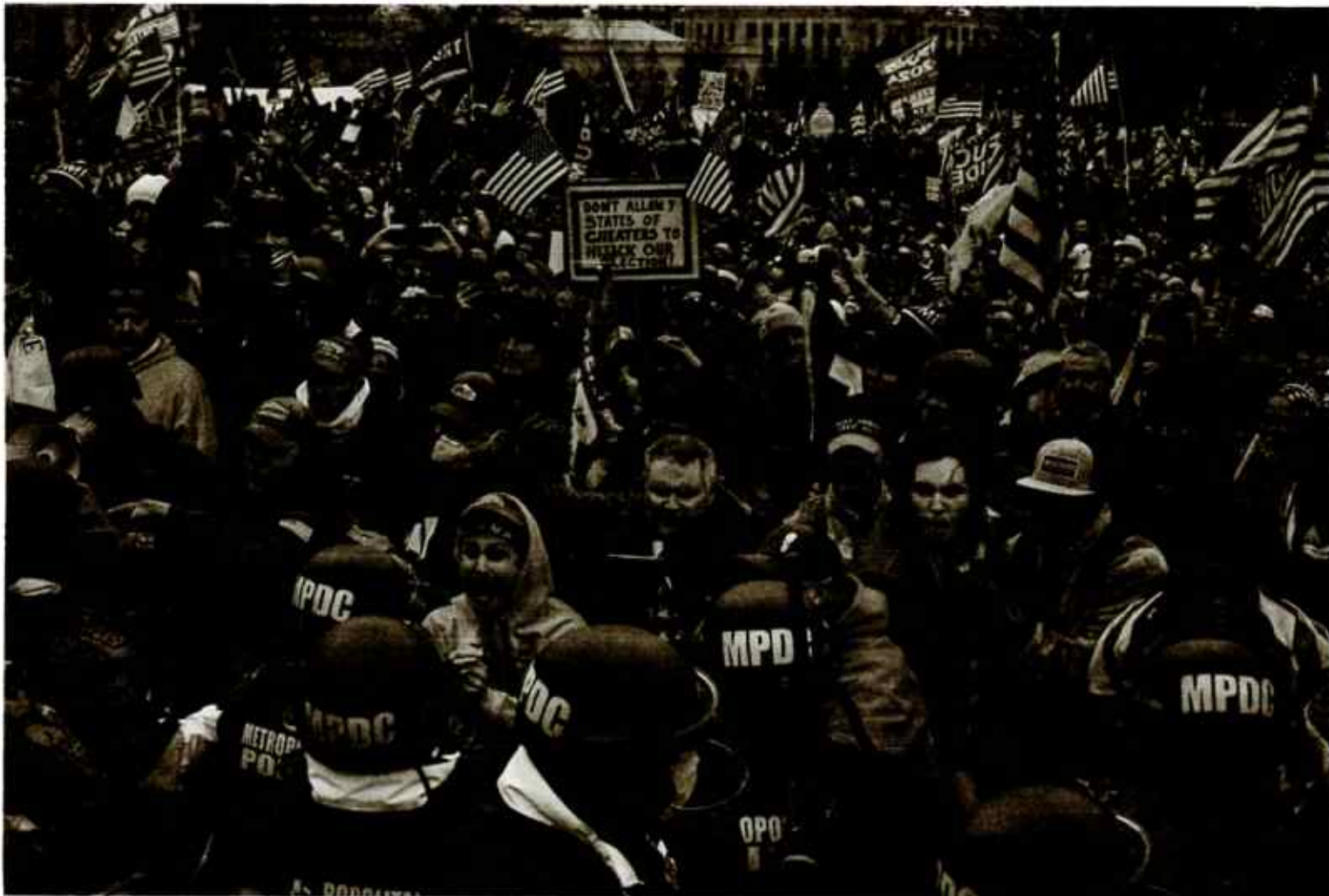
An angry mob confronted the police as it tried to gain entry into the Capitol, 2 p.m.

My own view is that greater knowledge of the past, fascist or otherwise, allows us to notice and conceptualize elements of the present that we might otherwise disregard and to think more broadly about future possibilities. It was clear to me in October that Trump's behavior presaged a coup, and I said so in print; this is not because the present repeats the past, but because the past enlightens the present.