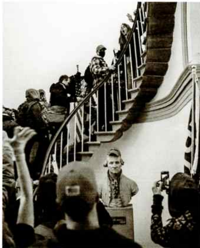
A bust of George Washington had a Trump hat placed on it, as intruders charged through the building, 2:34 p.m.

Thanks to technological capacity and personal talent, Donald Trump lied at a pace perhaps unmatched by any other leader in history. For the most part these were small lies, and their main effect was cumulative. To believe in all of them was to accept the authority of a single man, because to believe in all of them was to disbelieve everything else. Once such personal authority was established, the president could treat everyone else as the liars; he even had the power to turn someone from a trusted adviser into a dishonest scoundrel with a single tweet. Yet so long as he was unable to enforce some truly big lie, some fantasy that created an alternative reality where people could live and die, his pre-fascism fell short of the thing itself.