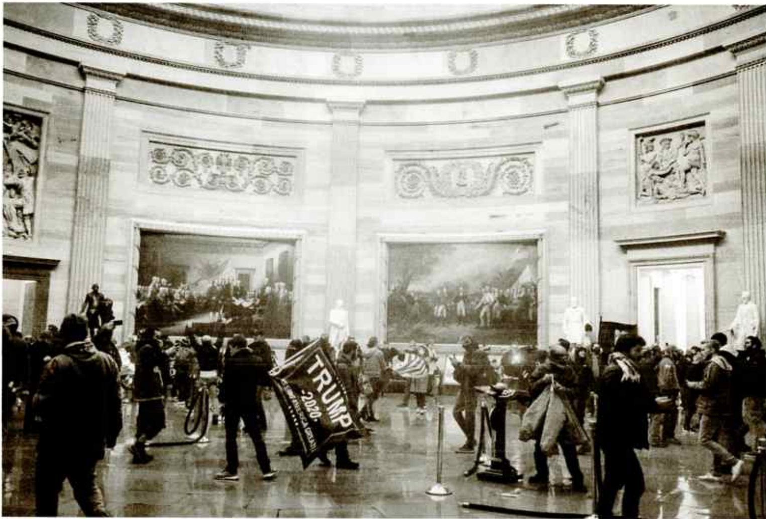
A mixture of tear gas discharged by police and fire-extinguisher residue discharged by pro-Trump extremists hung in the air of the Rotunda as the crowd milled about, 2:38 p.m.

The big lie requires commitment. When Republican gamers do not exhibit enough of that, Republican breakers call them “RINOs”: Republicans in name only. This term once suggested a lack of ideological commitment. It now means an unwillingness to throw away an election. The gamers, in response, close ranks around the Constitution and speak of principles and traditions. The breakers must all know (with the possible exception of the Alabama senator Tommy Tuberville) that they are participating in a sham, but they will have an audience of tens of millions who do not.