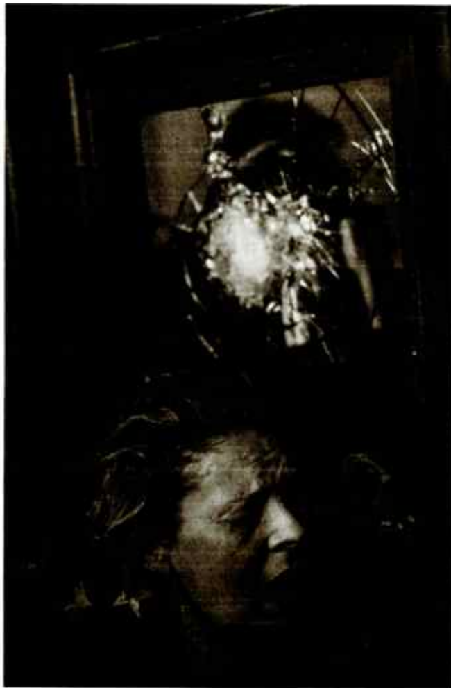
A woman who had been pepper-sprayed leaned on the eastern door to the Capitol's rotunda, 3:47 p.m.

The lie outlasts the liar. The idea that Germany lost the First World War in 1918 because of a Jewish “stab in the back” was 15 years old when Hitler came to power. How will Trump’s myth of victimhood function in American life 15 years from now? And to whose benefit?